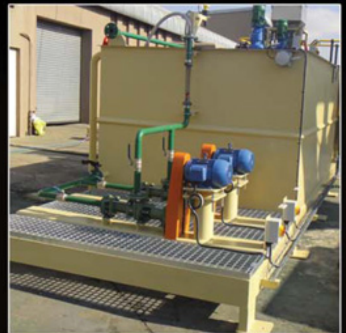
Skid mounted Flocculant Plant