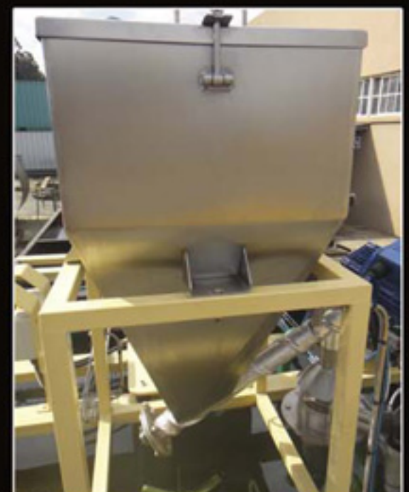
Flocculant wetting head